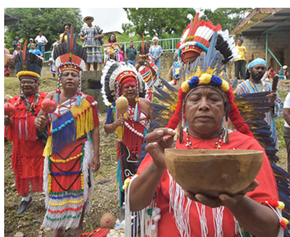
Amerindian water ceremony held last October at the Arima River off Wilson Street, off the Arima Blanchisseuse Road.

They've waited for more than 30 years, so far, for a bit of communal land to call their own. And if you include the time since their land was first stolen from them, they've been waiting for a great deal longer—over two centuries, in fact.